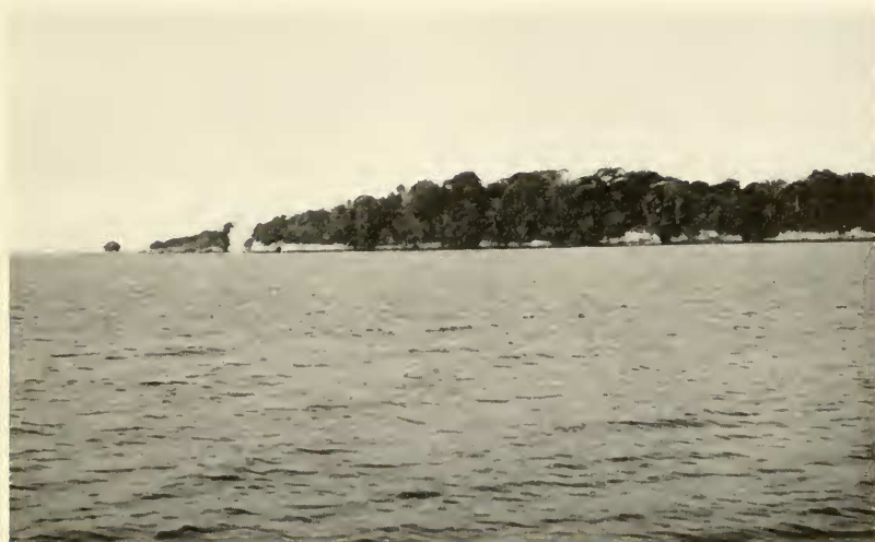
1. Western end of Isla Escudo de Veraguas, from the south.